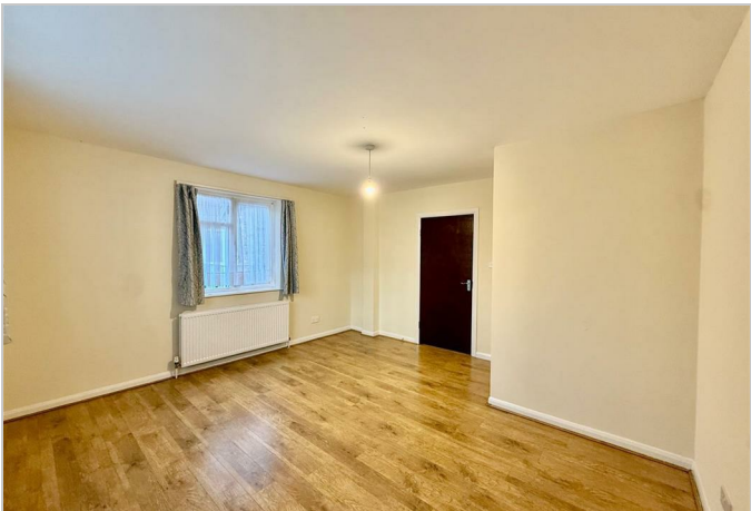
Modern 2-Bedroom Flat – Rainham Road South, Dagenham RM10

Please contact our Letting International LTD Office on 02085549999 if you wish to arrange a viewing appointment for this property or require further information.